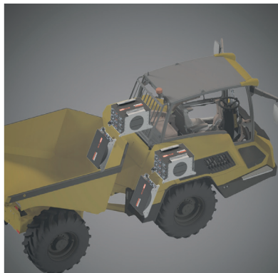
Lithium Ion Batteries